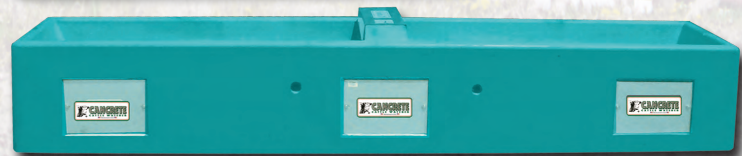
D800 Dairy and Big Feeder Bowl

"The Bad Boy" Our C550 will look after up to 700 Head of Cattle and is great for Free Stall Dairy Barns with or without Electrical!